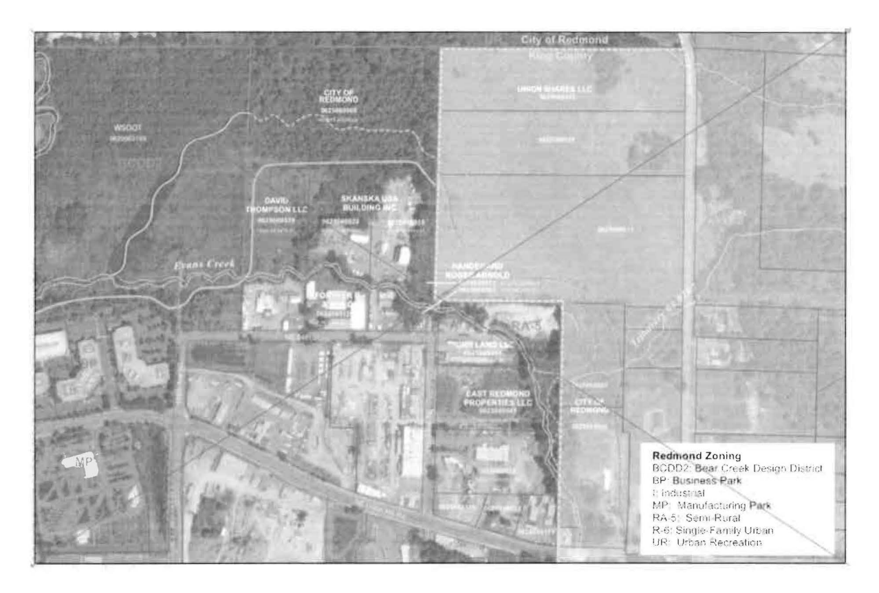
Zoning Classifications near Evans Creek Adopted by this Ordinance